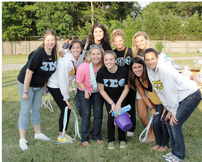
Zeta Sigma Phi sorority from St. Joseph's College