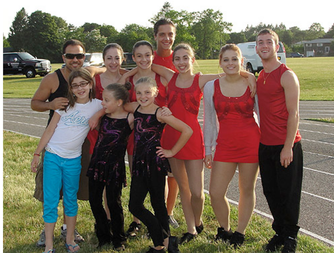
Ovations Dance Academy